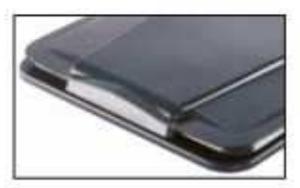
SL lid with handle strip on three sides