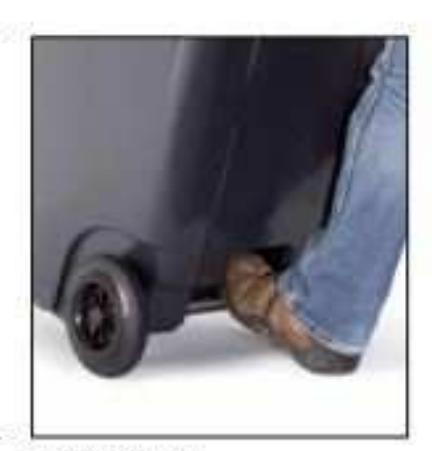
Ergonomic foot step