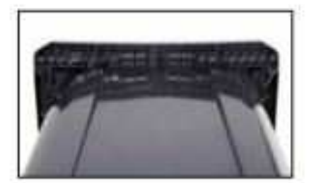
Robust comb receiver for lifting and emptying